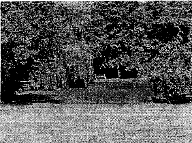
New bench by the pond.

Now that the Laurier development is substantially complete, and the retention basins were shown to have prevented damage to our streams and pond, we were able to begin work on our own pond restoration project. We have piped water from a nearby spring into the pond, dredged some of the muck out of the pond and removed some of the bulrushes. The water quality is improved. The landscaper is going to release some fish in the pond and the ducks already seem to be enjoying the improvements. We have placed a new bench by the pond.