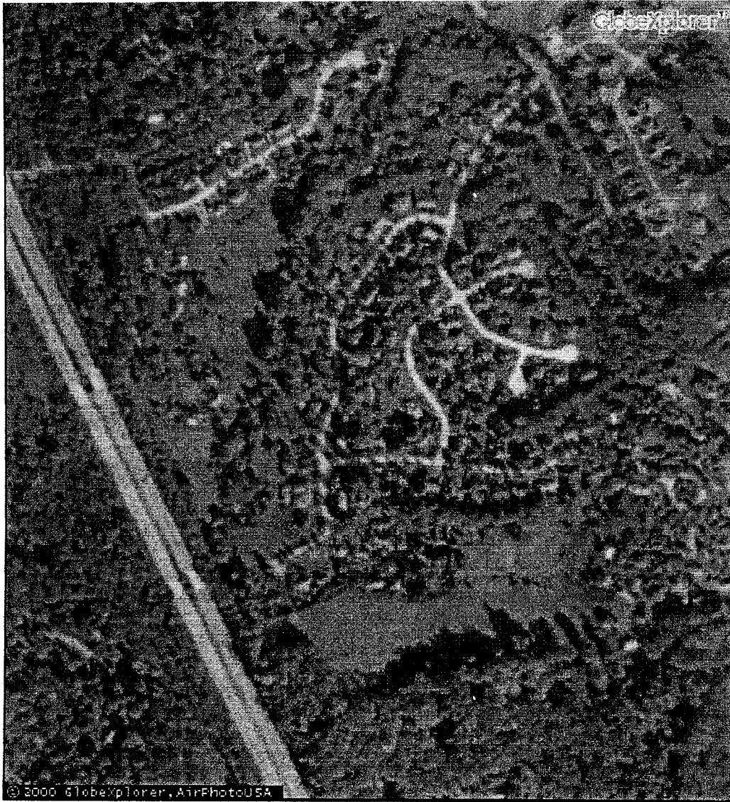
Aerial photo of Fox Fields. Can you identify your house?